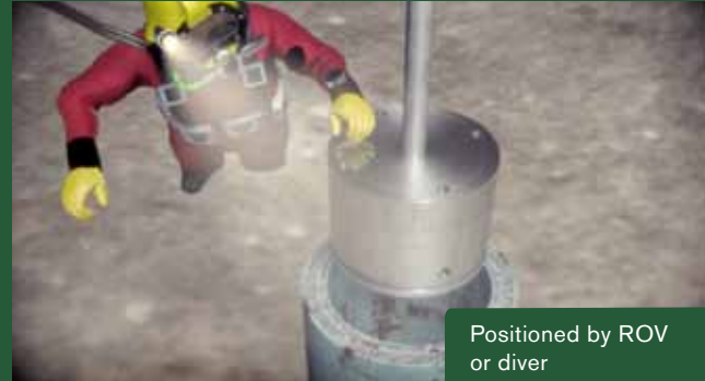
Positioned by ROV or diver