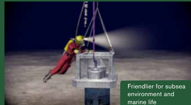
Friendlier for subsea environment and marine life

Developed by Chet Morrison Contractors, SHARC virtually eliminates the need for high-power jetting and explosives – and reduces overall job time by 60%.